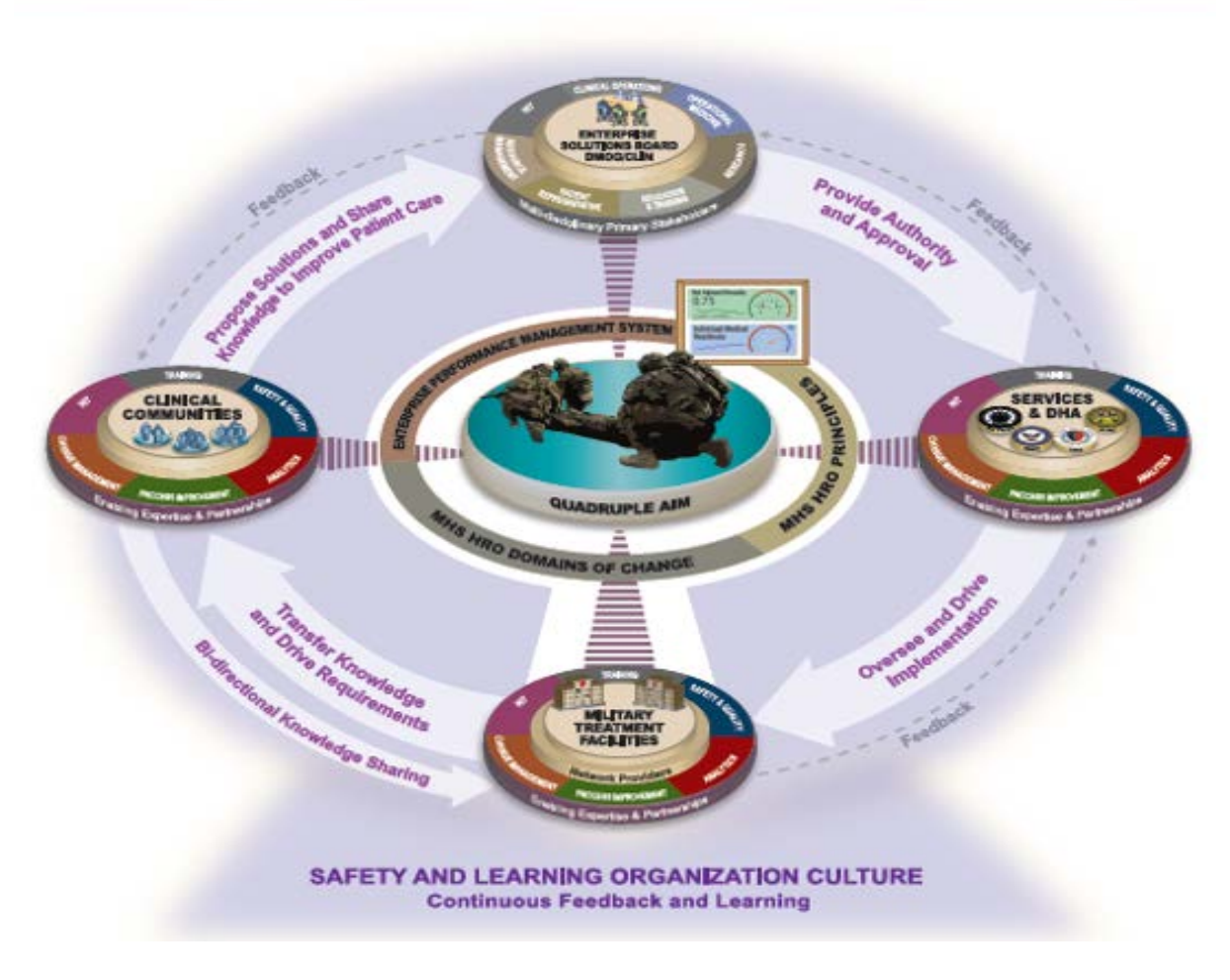
Figure 1: Military Health System Integrated Healthcare Delivery System: High Reliability Organization Operating Model